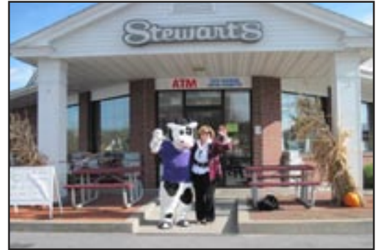
Stewarts - a long time supporter of healthy kids and healthy families

Assemblyman Robert Reilly Salary Fund (through The Community Foundation for the Greater Capital Region) Bank of America Community AIDS Partnership of the Capital Region Saratoga Springs Community Development Block Grant Emergency Food and Shelter Program Hawley Foundation Key Bank Legal Aid Society of Northeastern New York New York State Coalition Against Sexual Assault New York State Coalition Against Domestic Violence New York State Department of Health New York State Division of Criminal Justice New York State Hunger Prevention and Nutrition Assistance Program New York State Office of Children & Family Services New York State Office of Temporary and Disability Assistance New York State Office of Victim Services New York State Temporary Assistance for Needy Families New York State Integrated Domestic Violence Court Saratoga Casino & Raceway Foundation Saratoga County Citizens Committee for Mental Health Soroptimist International of Saratoga County Stewarts Holiday Match Sunshine Lady Foundation United States Department of Housing and Urban Development United Way of the Greater Capital Region Verizon Wireless Women's Fund