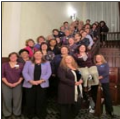
Soroptimist International of Saratoga County

Project Hope and Power is an eight week education and mentoring program designed to give women the skills they need to increase their options for independence through financial empowerment. The program is a partnership between Soroptimist International of Saratoga County and Domestic Violence and Rape Crisis Services, and has been helping women reach financial independence since the fall of 2005. The training is offered 3 times each year; there are 8 workshops per session. To date 177 students have enrolled; and 143 have completed the program. The bottom line - these 143 women and their families have acquired and practiced the skills and knowledge needed for them to become financially independent and stable. In 2010 Powering Up, a set of six ‘graduate’ workshops, covering topics from financial goal setting to investing to career movement, was created and offered to women who had successfully completed the Hope and Power program.