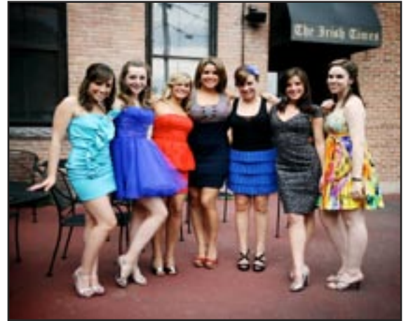
Girls Just Wanna Have Fun!

Countless organizations provided in-kind support of events, from food to fanfare, linens to lighting, gift baskets to professional services. While we cannot list them here we are tremendously grateful and aware that our events would not be successful without their generous help.