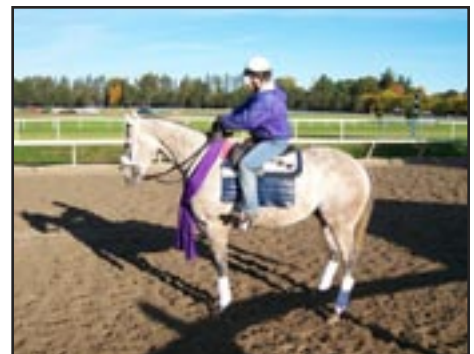
Everyone can be purple!

The Saratoga State Park and Domestic Violence and Rape Crisis Services launched an innovative sexual assault early intervention program at the park during selected summer concerts. DVRC provided advocates on site for early intervention to reduce the risk of sexual assault among concert attendees. The Park also took vigorous efforts to decrease underage alcohol consumption and over-consumption of alcohol among all concert goers. Per the NYS Office of Parks, Recreation and Historic Preservation, the 2010 season was 'one of the safest on record'.