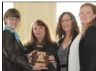
The DVRC team receives the Liberty Bell Award