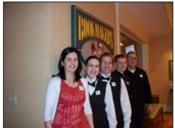
Holiday Inn Saratoga Winterfest Wine Tasting