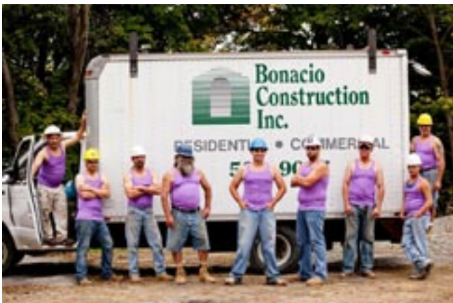
Bonacio dons their purple to END domestic violence

“You have changed our lives knowing so many people out there care so very much for us! Thank you!”