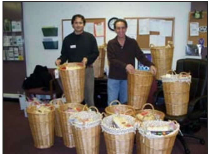
A Thanksgiving Feast, compliments of the Wilton Kiwanis!

and Power workshops. Another 30 households renewed their volunteer commitment to foster a pet of a family in shelter. In late 2010 an Ambassador program was initiated. These volunteers will approach community organizations with information and flyers to open the dialog around the prevalence and impacts of domestic violence.