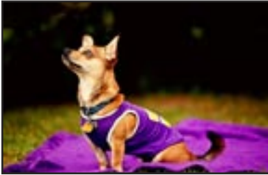
Color Me Purple in the park!

In December, 2010 the Board of Directors created and approved a 5 year strategic plan. One of the components of the plan was an increased emphasis on community education and participation in the efforts to end relationship violence. To succeed at this goal Domestic Violence and Rape Crisis Services will take on more proactive and preventive measures to engage community members in the future.