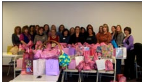
Hope delivered in hundreds of baskets!

“I’d like to give thanks to Domestic Violence and Rape Crisis Services for giving me back my courage and helping me to remember who I am. As well, DVRC encouraged me, and through the New View program, provided me a safe environment to pursue my life with purpose.”