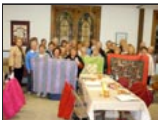
Many, many Loving Hands

New View, a DVRC program providing permanent supportive and transitional housing to families who would otherwise be homeless, housed an additional 20 adults and 27 children in 2010. This initiative not only saves Saratoga County significant funds in the effort to reduce homelessness, it also provides support services enabling families to break the cycle of poverty and homelessness and become productive contributors to their communities.